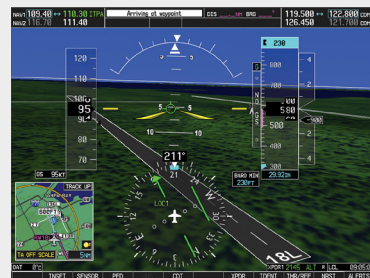
Runway designations and thresholds are superimposed on terrain data; Unique runway highlighting and enhancements improves runway visibility from a distance.