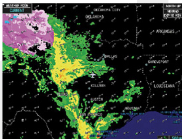
World Wide Weather Data-Link and SATCOM.