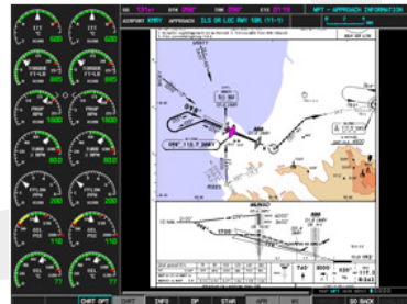
Optional ChartView™ lets pilots accurately overlay their aircraft's position on approach procedures and airport diagrams. Standard Instrument Departure and Arrival charts (SIDs and STARs) are also provided. (Requires Jeppesen subscription)