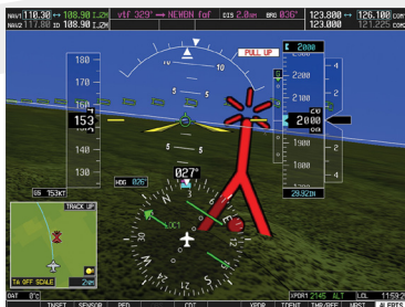
Any towers or obstacles that may encroach upon the flight path are color-highlighted and clearly displayed with height-appropriate symbology.