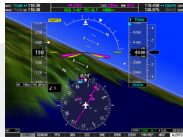
TCAS/TAS/TIS traffic technologies depict targets in 3-D perspective, so you can visually gauge how high and how close they are. Plus, the familiar color- and shape-cued TCAS symbology grows larger as it gets nearer – making traffic conflicts easier to see and identify.